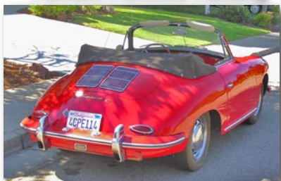
Street parking has risks but very little on Ted's quiet residential street.