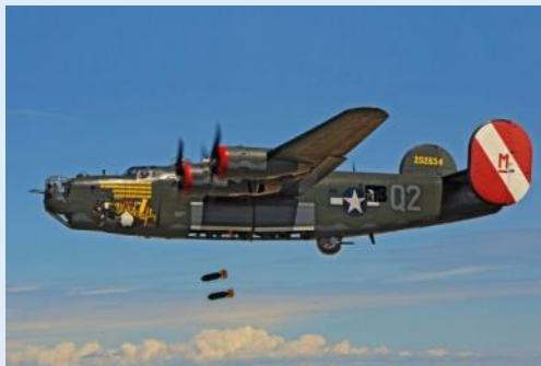
Consolidated B-24 Liberator