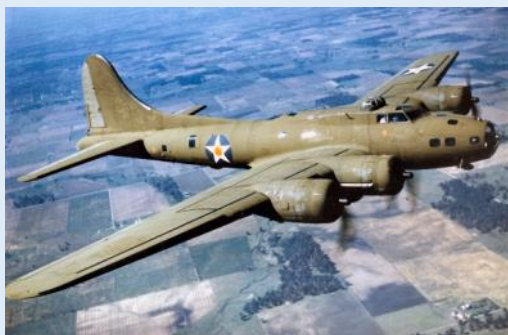
Boeing B-17 Flying Fortress

The activity is pay as you go, however please register on Eventbrite because we need a head count to reserve tour space. The first afternoon flight in the B-24 starts after the walking tour is done for the day, which is approximately 5 pm. Maximum number of passengers in a B-24 is 10 so we would like to reserve all 10 spots for PCA. If we have more than 10 people, we will reserve space in either the B-17's 5 pm flight or the B-24, 5:30 flight. If we do not fill an entire flight, we will have to wait until those spots are filled by other people.