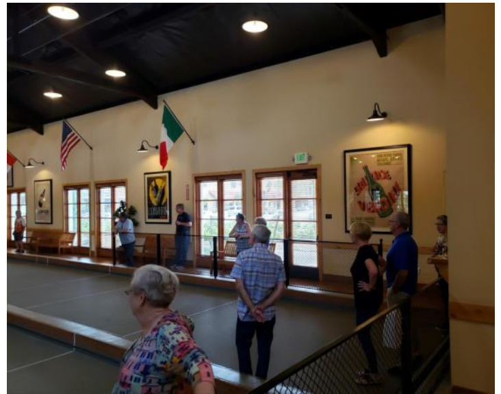
Intense play! Every roll counts!