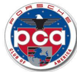
Porsche Club of America