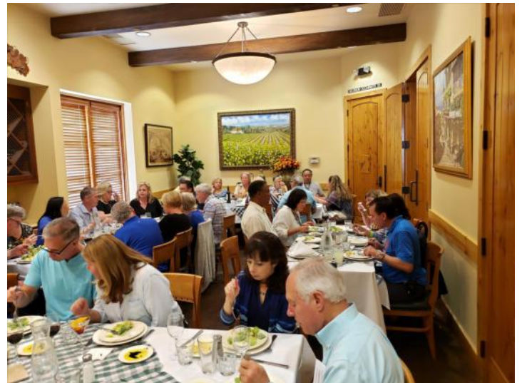
We filled up the entire private dining area!