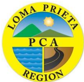
Loma Prieta Region