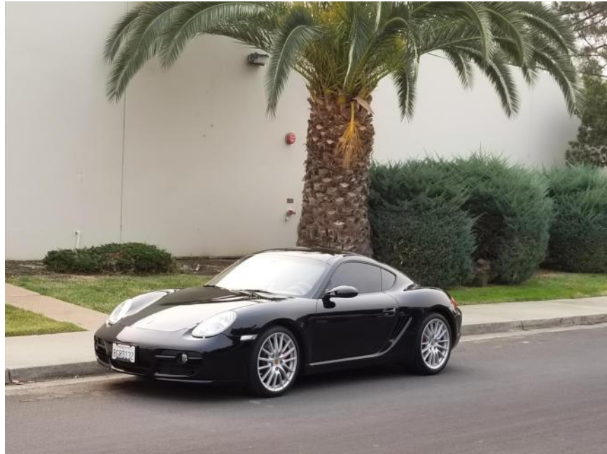
2007 Cayman S in Livermore outside the Nottingham Winery