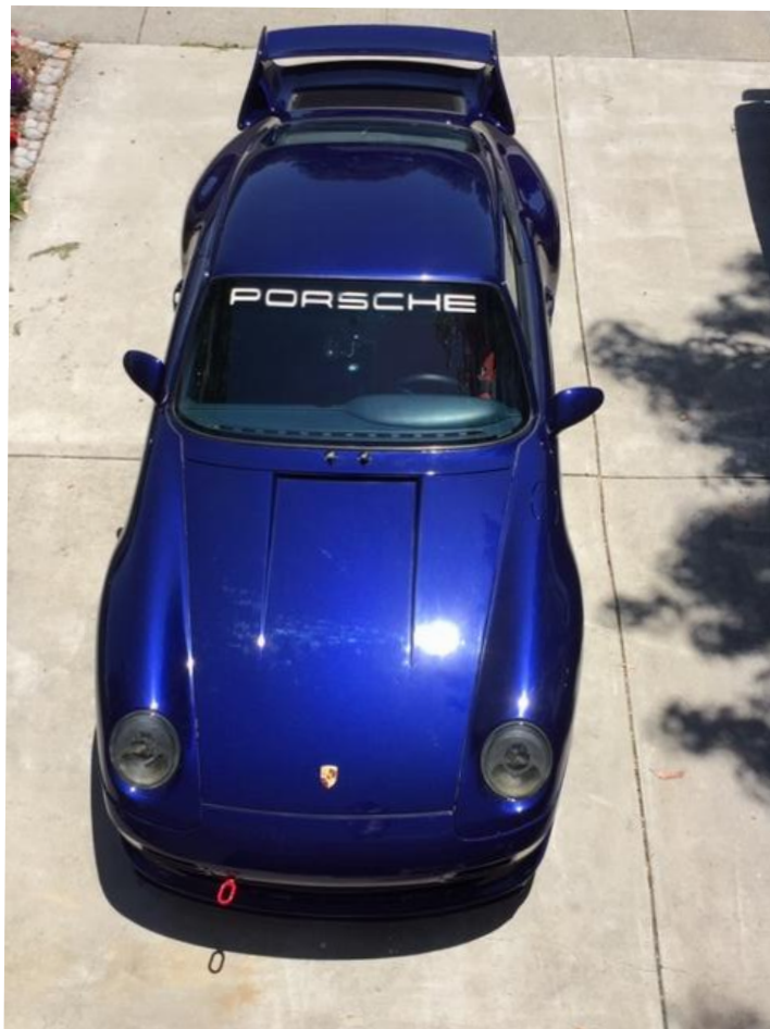
Taken while doing everyone's favorite chore – cleaning out the rain gutters.