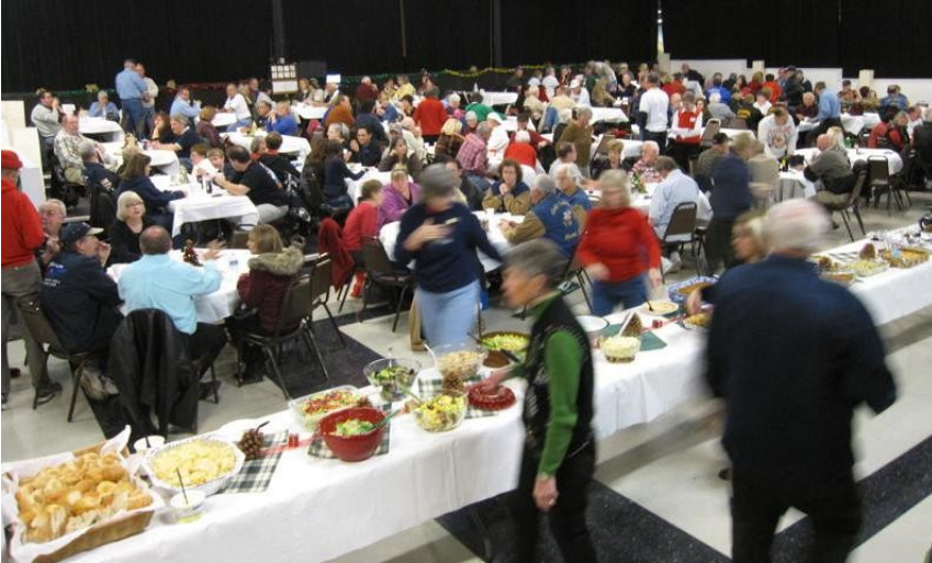
The "rush" to the enormous potluck buffet.