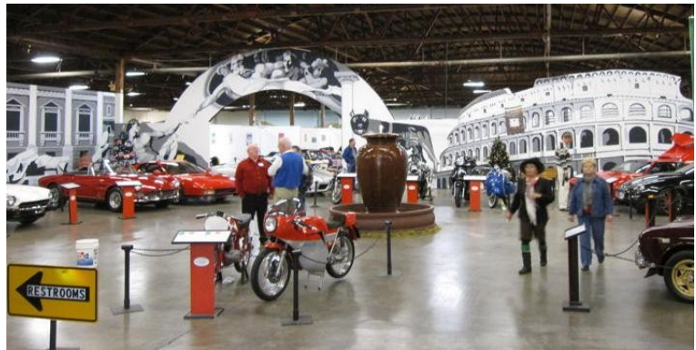
The awesome display