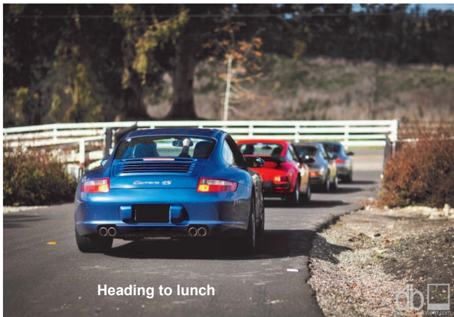
Heading to lunch