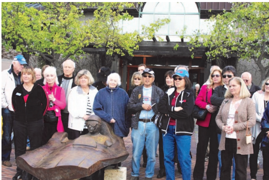
The gang looks intrigued