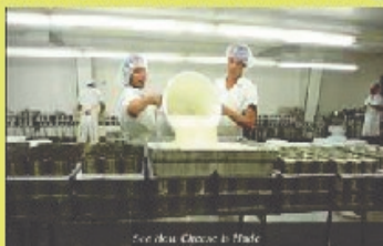
See how Cheese is Made