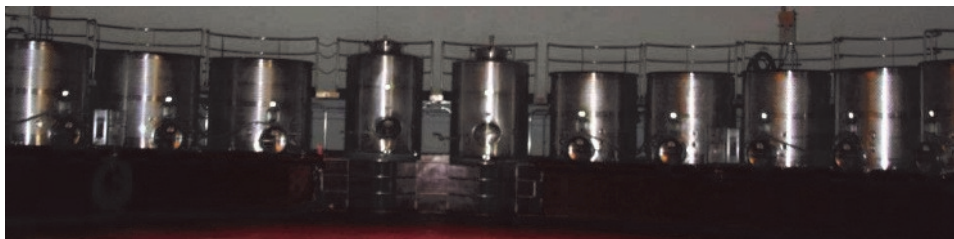
Tanks of yummy wine!