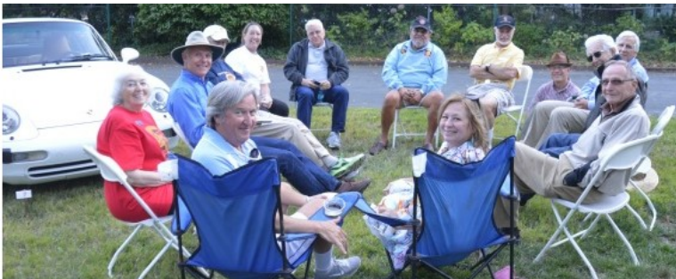
Just about all of our entrants enjoying the event