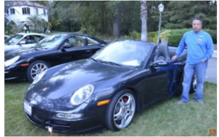
Winner of our giant recycled First Entrant trophy Al Arrivas