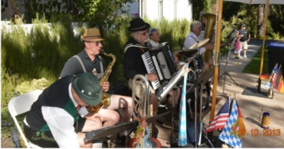
Eight piece German Oompah band

The Casa de Flores Oktoberfest event sponsored by the Moraga town council on October 13, 2013 was attended by several Diablo Region members. I think you can agree that the pictures provided by Jack Carpenter show there were smiles all around.