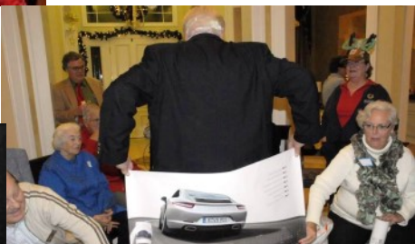
Interesting White Elephant