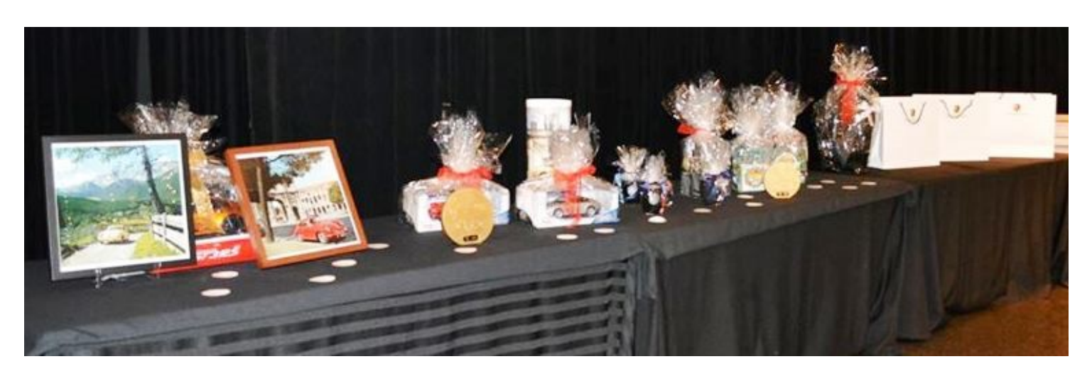
Generous donations for the raffle