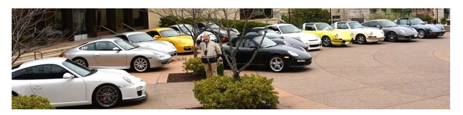
Blackhawk Museum Rotunda all decked out