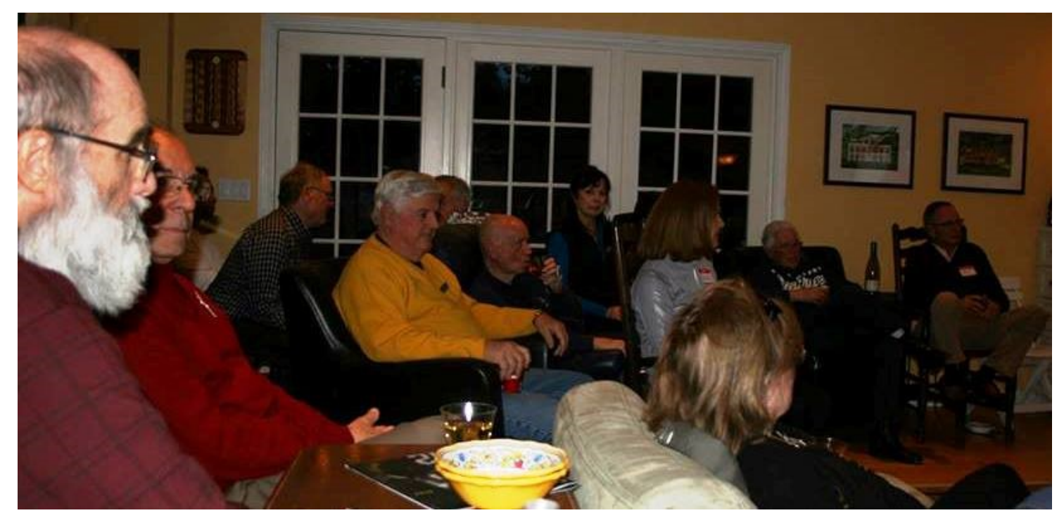
All eyes on the game.