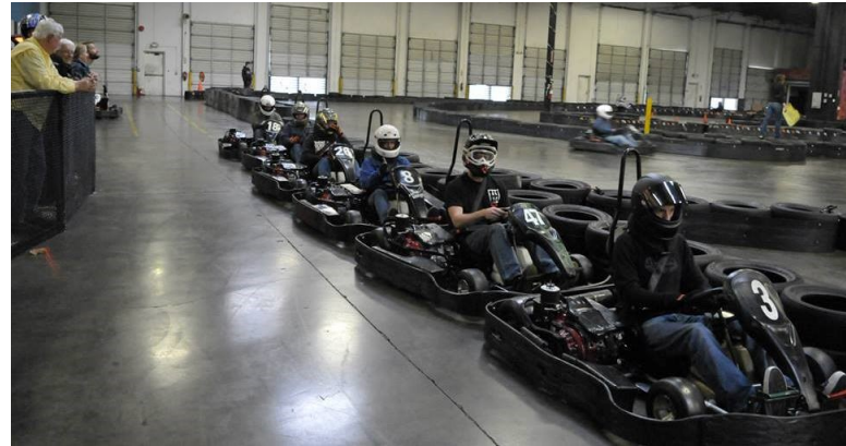
Lined up and ready to go!