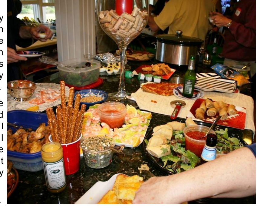
The island is groaning with all the food.