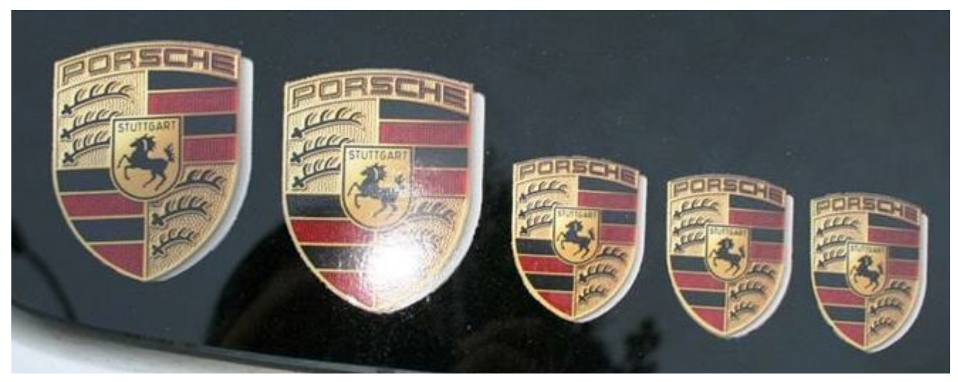
Someone has Porsche Pride!