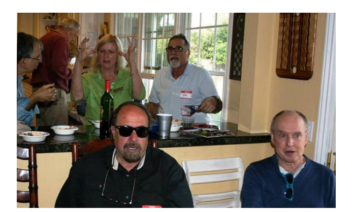
Something dramatic must have happened