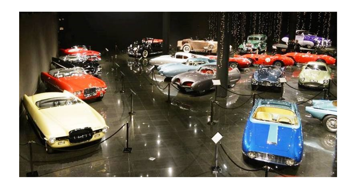
More cars on display