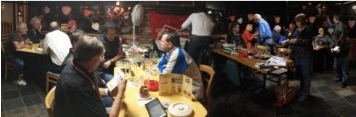
Dinner at Casa Ramos the night before

During the day, there had been many highlights and lessons on driving in the rain. Even though the day was cut short by two hours, drivers seemed satisfied with their individual results and looking forward to April 7th at Mazda Raceway at Laguna Seca.