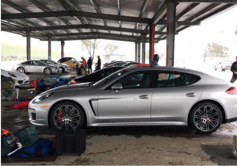
Staying Dry Under the Tarmac