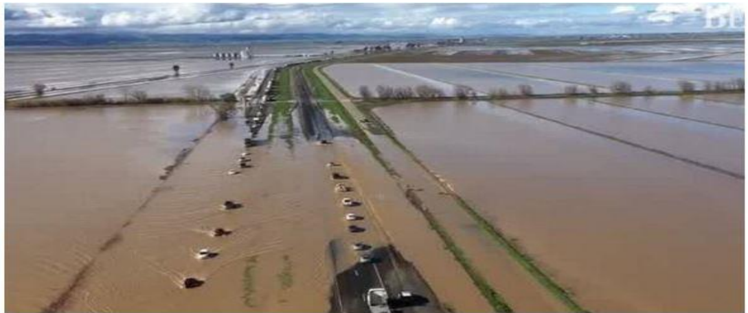
Flooded Interstate 5 Near Williams