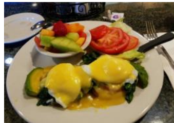
Vegetarian Eggs Benedict for our vegetarian members