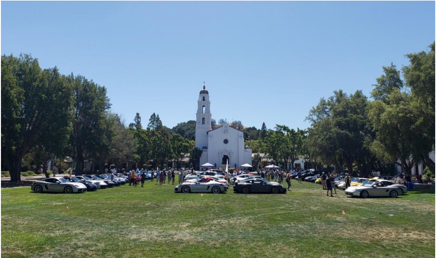
Diablo PCA Region Summer Picnic & New Member Recognition