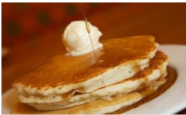
For something simple: Buttermilk pancakes