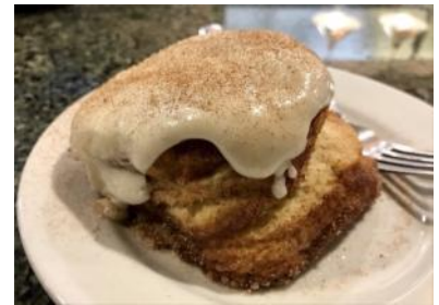
One of their specialties - Frosted Cinnascuit (House made biscuit dipped in cinnamon sugar, baked & topped with a cream cheese frosting)